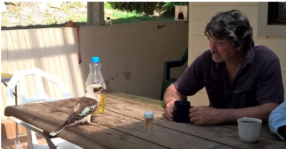
Above a recent photo of the resident Blue Winged Kookaburra.

Some of the birds in the Valley are very tame as unfortunately not everyone has followed the rules. Although this can provide some great photo opportunities, please resist the urge to feed the animals. Often if animals become too tame they can become a nuisance and have to be relocated, or worse they become reliant on humans and forget how to fend for themselves.